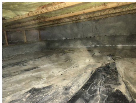
mineral line and damaged vapor barrier