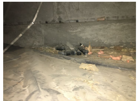
debris and damaged vapor barrier

Ness, LLC gives a 10 Year Warranty on sump pump, drain system for no standing water (as per signed contract) on the crawlspace floor where drain was installed from ground water seepage, and rain/snow. This Warranty is Transferable to new home buyer within warranty period. Drainage Warranty excludes water standing on the crawlspace floor from flooding that is not part of ground water seepage from irrigation or rain or due to, interior home appliances or plumbing leaks. Furthermore, Ness, LLC is not responsible for any future landscape changes that may disrupt the system. A Service Charge applies for non-warranty issues.