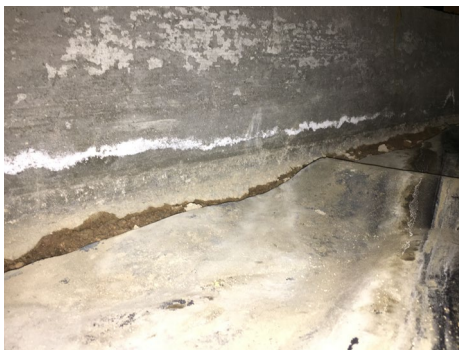
mineral line shows repeated evaporation

Part 4: Remove and dispose of old vapor barrier, miscellaneous debris, and building materials in the right bay where the system will be installed. Install new 6 mil. vapor barrier, where removed, and pull up onto the footings, where possible. ADD to Total = $635.31