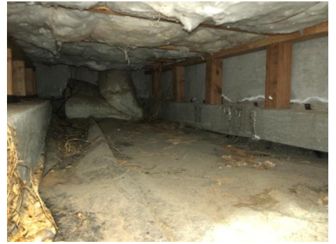
debris in crawl and hanging insulation

>> Paid out of closing as long as closing is within 21 days of job completion or 50% down and 50% paid upon completion << >> 3% charge on credit card transactions <<