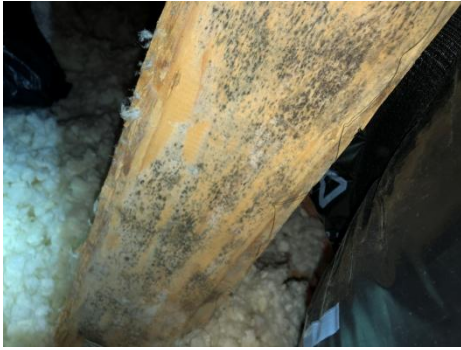
visible mold in attic