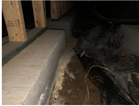
damaged plastic-not pulled up on footing